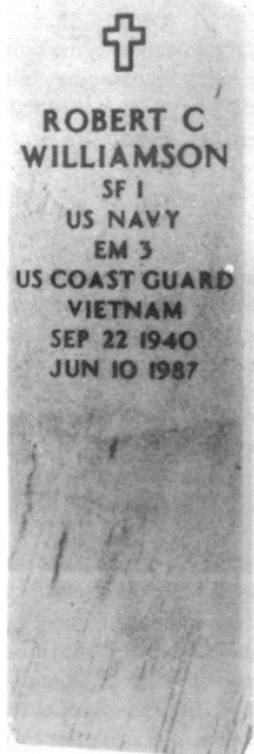
UPRIGHT HEADSTONE WHITE MARBLE OR LIGHT GRAY GRANITE

This headstone is 42 inches long, 13 inches wide and 4 inches thick. Weight is approximately 230 pounds. Variations may occur in stone color, and the marble may contain light to moderate veining.