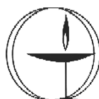
(8) UNITARIAN CHURCH (Flaming Chalice)