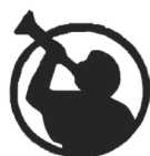
(11) MORMON-ANGEL MORONI