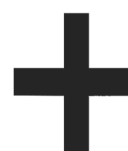
(14) GREEK CROSS