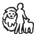
(20) COMMUNITY OF CHRIST