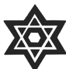
(3) JUDAISM (Star of David)