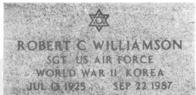
LIGHT GRAY GRANITE OR WHITE MARBLE

This grave marker is 24 inches long, 12 inches wide, and 4 inches thick. Weight is approximately 130 pounds. Variations may occur in stone color; the marble may contain light to moderate veining.